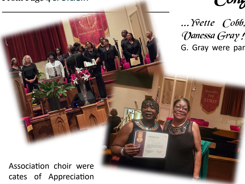
Association choir were cates of Appreciation Program Coordinator.